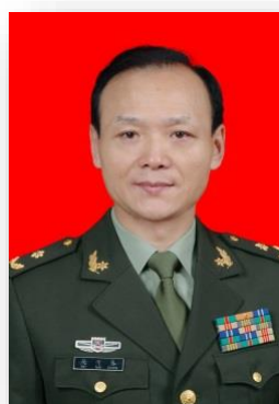
Kaichun Wu Congress President

The Brazil-Russia-India-China-South Africa IBD Consortium BRICS 2021